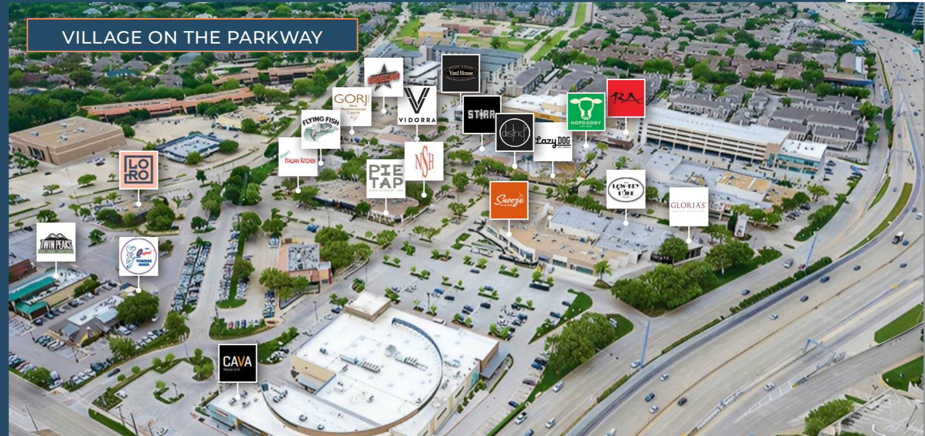
VILLAGE ON THE PARKWAY